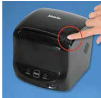
Designed for Jam-Free Operation