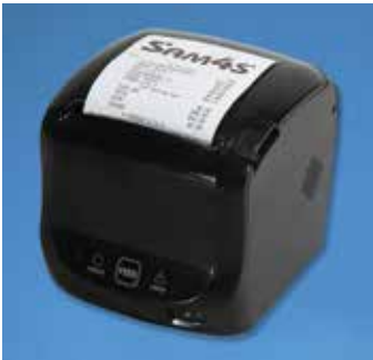
The Giant 100 Accommodates Up to 3" Wide Thermal Receipt Paper