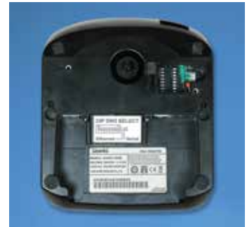
Easy Access to Dip-Switches / Tool-Free Access Optimizes Serviceability