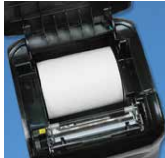
Drop and Print Paper Loading – Optional Paper Width Selector Allows 58mm Wide Paper Rolls